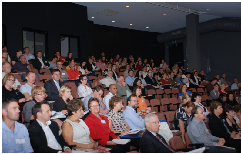
Conference participants, National Convention Centre, Canberra

The 2010 Sentencing Conference was hosted jointly by the National Judicial College of Australia and the ANU College of Law on 6 & 7 February 2010.