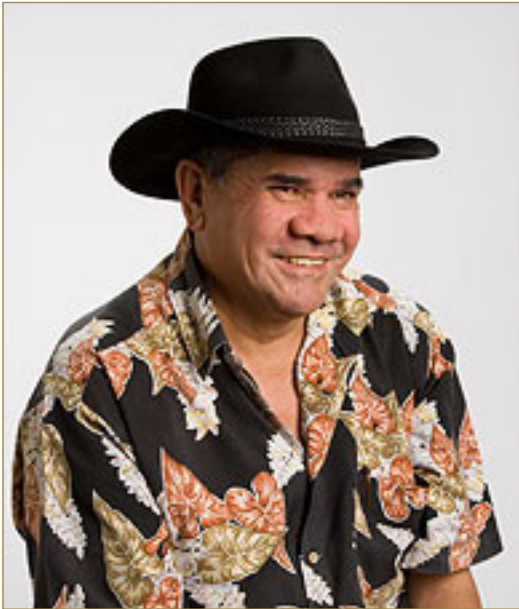
Prof.essor Mick Dodson AM

ANU College of Law congratulates Professor Mick Dodson on becoming the Australian of the Year 2009. Professor Mick Dodson is a member of the Yawuru peoples the traditional Aboriginal owners of land and waters in the Broome area of the southern Kimberley region of Western Australia. He is currently Director of the National Centre for Indigenous Studies at the Australian National University and a Professor of law at the ANU College of Law.