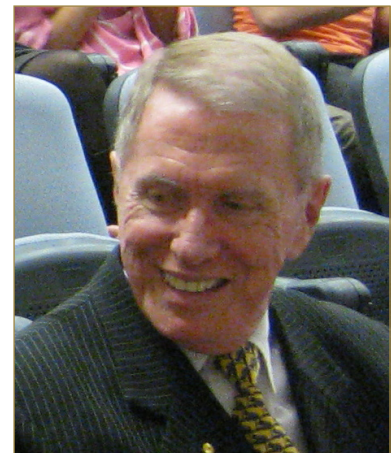
Justice Michael Kirby