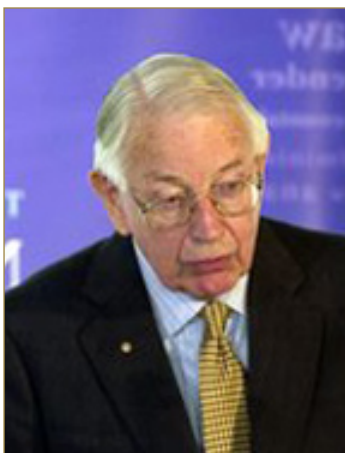
Sir Anthony Mason AC KBE

Sir Anthony Mason will again visit the Faculty in 2009 as a Distinguished Visiting Fellow to give talks to staff and students of the Faculty.