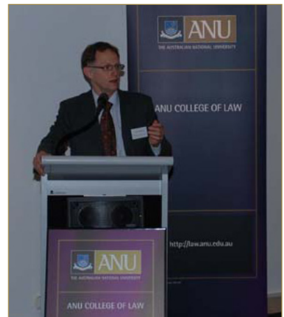
Stephen Gageler SC

For more details see: the announcement by the Attorney-General.