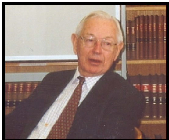
Sir Anthony Mason

The Centre was honoured to have the Faculty's inaugural Distinguished Visiting Fellow Sir Anthony Mason in our midst from 20-24 August. During his visit to the Faculty Sir Anthony gave several lectures to students and a public lecture The Rule of Law in China and the Special Administrative Region of Hong Kong . The text of this lecture will be published by the Centre in due course.