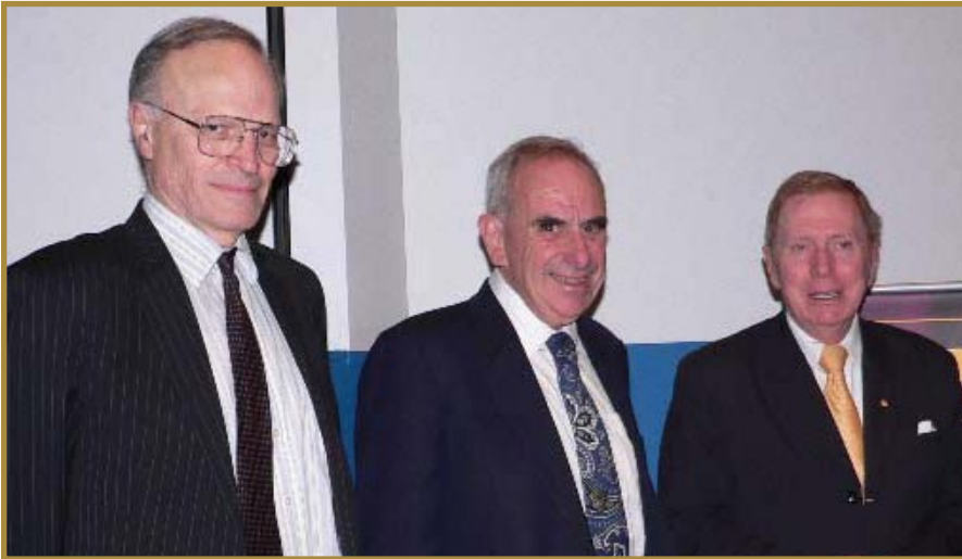
Above: Justice Dyson Heydon AC, Lord Hoffmann, and Justice Michael Kirby AC, CMG

Lord Hoffmann, House of Lords, delivered a public lecture on Liberty and Terror at the ANU, 30 July 2008.