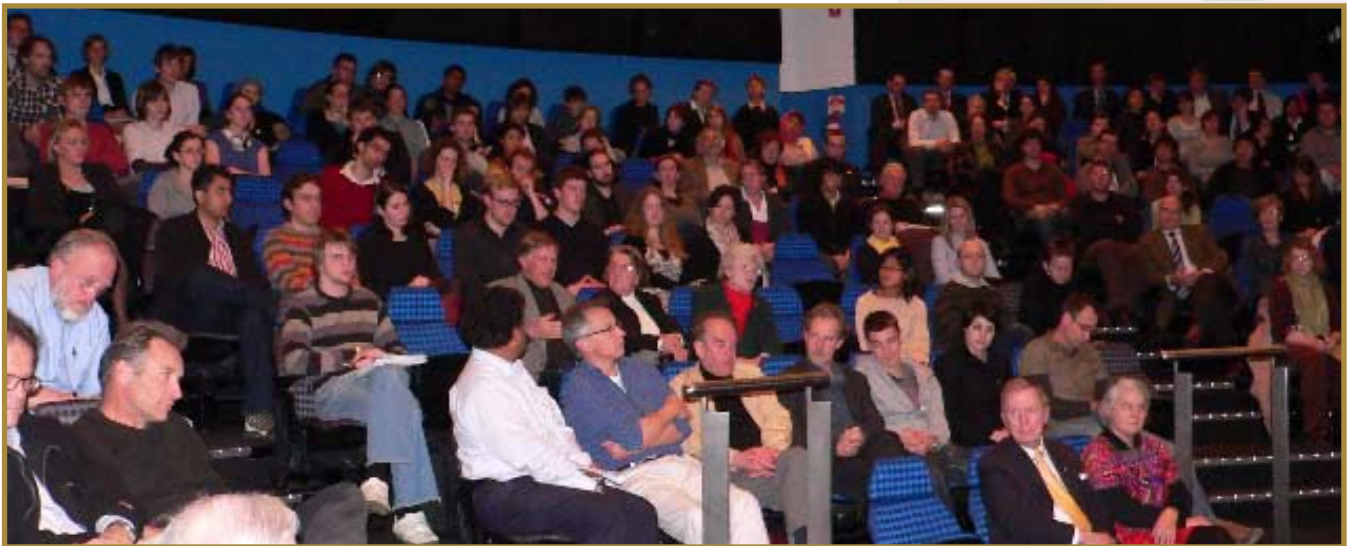
Above: Lecture audience in the Finkel Theatre, ANU

Lord Hoffmann, House of Lords, delivered a public lecture on Liberty and Terror at the ANU, 30 July 2008.